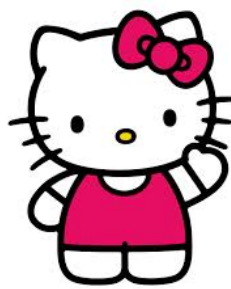
Hello Kitty gg, FF, ss, bb